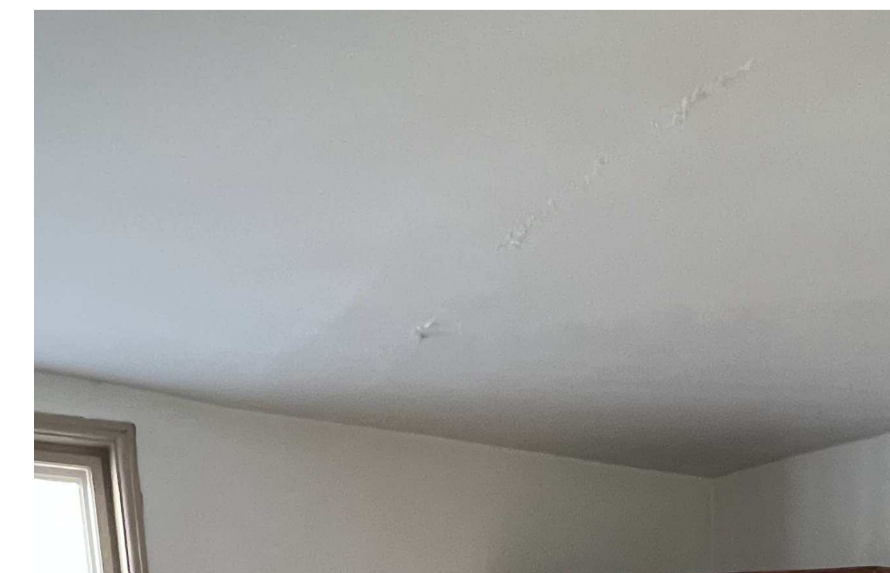
EAST CEILING PLASTER

NOTE: THE OFFICE OF DEAN ROBERT CAMLIN & ASSOC., INC. ASSUMES NO RESPONSIBILITY FOR THE ACCURACY NOR FOR THE COMPLETENESS OF EXISTING CONDITIONS AS SHOWN ON THESE DRAWINGS. ALL FEATURES AND DIMENSIONS SHOULD BE VERIFIED BY CONTRACTOR PRIOR TO BEGINNING WORK.